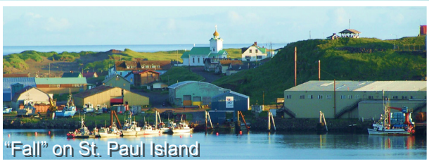
"Fall" on St. Paul Island

Employees of the Quarter Hack Proof your Smart Phone P4